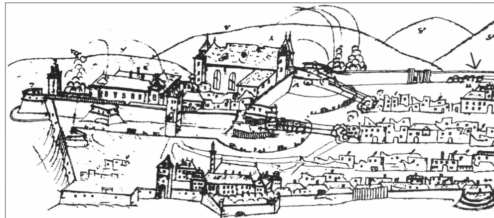
C.2.4 Pécs 1664-es vagy 1686-os ostroma, ismeretlen szerző tollrajza Kommentár: Sudár Balázs C.2.4 Ink drawing of the 1664 or 1686 siege of Pécs by an unknown author Commentary by Balázs Sudár

presence of a bastion strengthening the middle of the southern wall. The other details cannot be assessed due to the inaccuracies in the representations by Schmidtmayr. Regardless of its date, this ink drawing is quite certainly the best and most accurate representation of Pécs in the Ottoman period, which comprises many authentic elements. It is a great pity that only the western half of the town is visible in it.